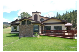
Swickard Women's Center

Read the rest of the story at www.harmonyfoundationinc.com/programs-services